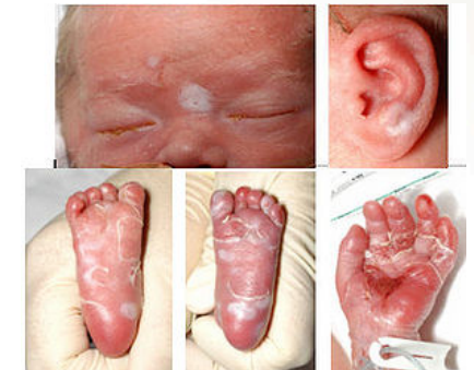
Figure 3: Skin Abnormalities in a Syphilis-Infected Neonate

Retrieved July 10, 2016 from https://microbewiki.kenyon.edu/index.php/Syphilis_in_Sub-Saharan_Africa